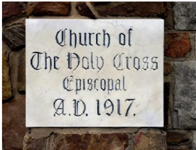
Cornerstone of Holy Cross