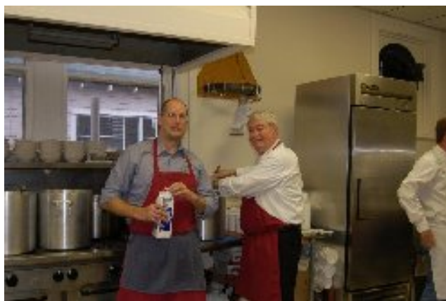
Members of the Brotherhood cook for one of the October Luncheon Fundraisers.

The guild works in three teams as “housekeepers” of our Lord’s house. They clean all linens and vestments, polish the silver and brass, refill the candles and do all other chores that are essential for services. The guild also maintains the “flower calendar” and decorates the church at Christmas and Easter. All confirmed members of the church are invited to join.