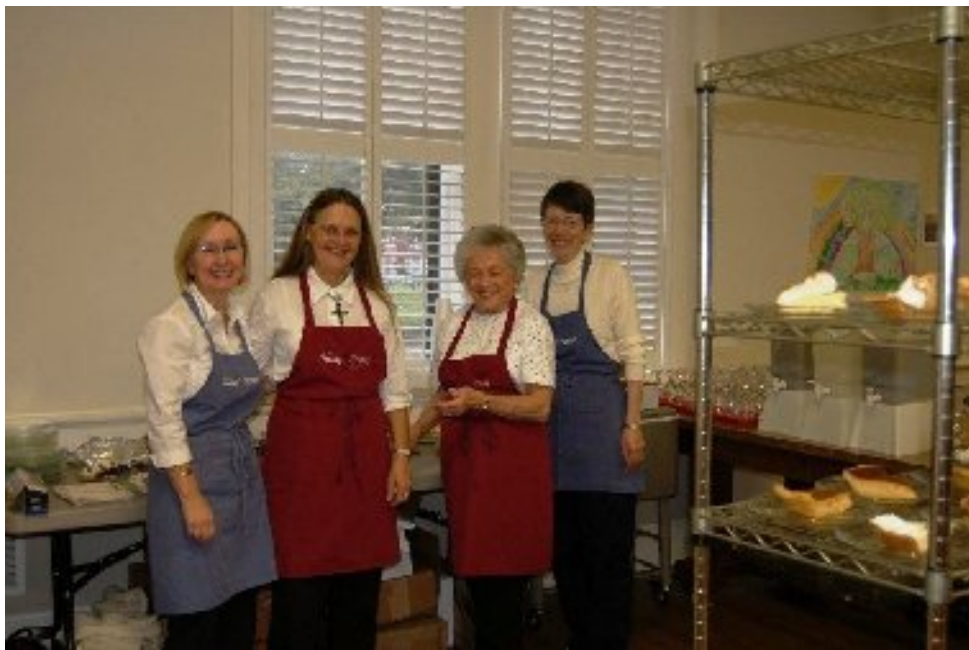
Some of the ladies prepare the drinks and desserts for the Spring Salad Luncheon.

Outreach projects include Co-Ministry, Children's Advocacy, Church Women United as well as St. Paul's Episcopal Mission in Brownsville, Texas. They purchase equipment for the parish hall, kitchen, rectory and Ruth Hall (school building). In addition, The Women of the Church pays a portion of the Christmas bonuses for the church staff and helps support Holy Cross's outreach through the clergy outreach fund (discretionary).