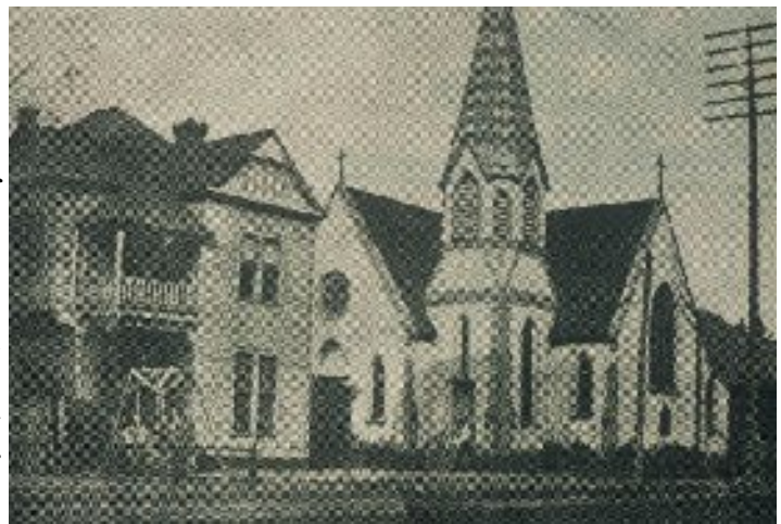
Rectory & Church prior to the fire of 1916