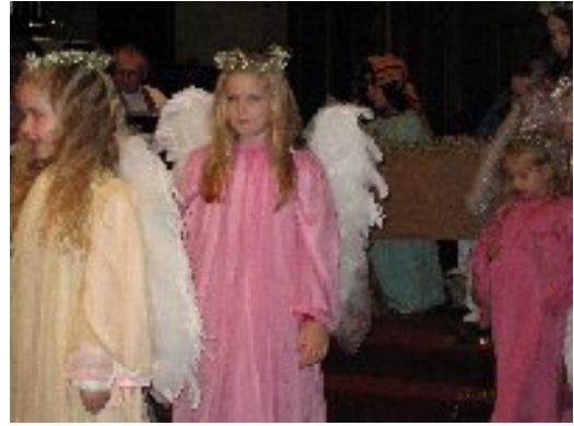
Children's Christmas Pageant in vintage costumes