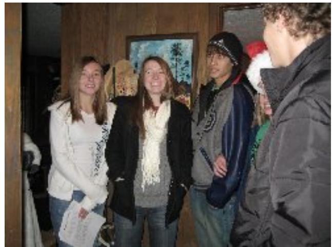
The Christmas Carol Fundraiser is fun!

Holy Cross is blessed to have a very active Junior and Senior EYC. This group of young people are very involved in the social activities of this parish. They participate in the preparation of the October and the Spring Luncheons. In the fall, they collect can goods and deliver Thanksgiving baskets to the needy and help host the annual Halloween carnival. They also visit nursing homes, sponsor the Easter Egg Hunt, host the Mother's Day reception, and participate as acolytes. They accomplish most of their goals planned during their Sunday evening meetings. There they also enjoy fun, food and educational activities.