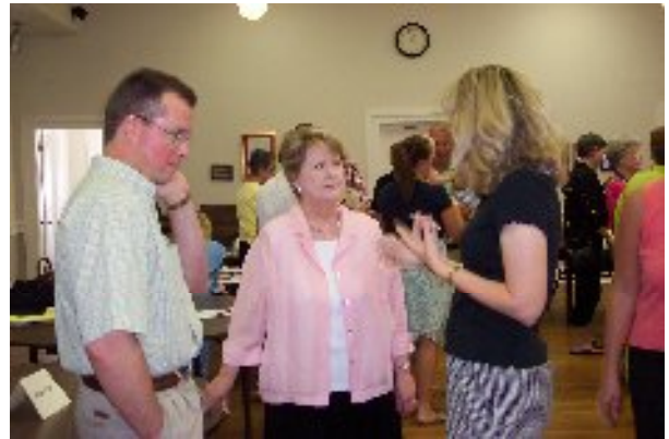
Making plans on Rally Day

We continue to offer special events such as the Mother's Day reception, Sunday School kick-off luncheon, Shrove Tuesday Pancake Supper and Talent Night, Halloween Festival, Women of the Church luncheons and other events. These programs provide special opportunities for fellowship for both members and visitors. (We LOVE to get together!)