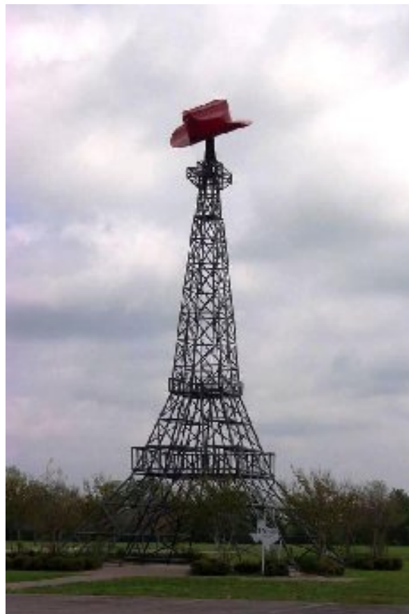
Paris TX Eiffel Tower complete with a Stetson Hat.

The Lamar County Chamber of Commerce website address is www.paristexas.com .