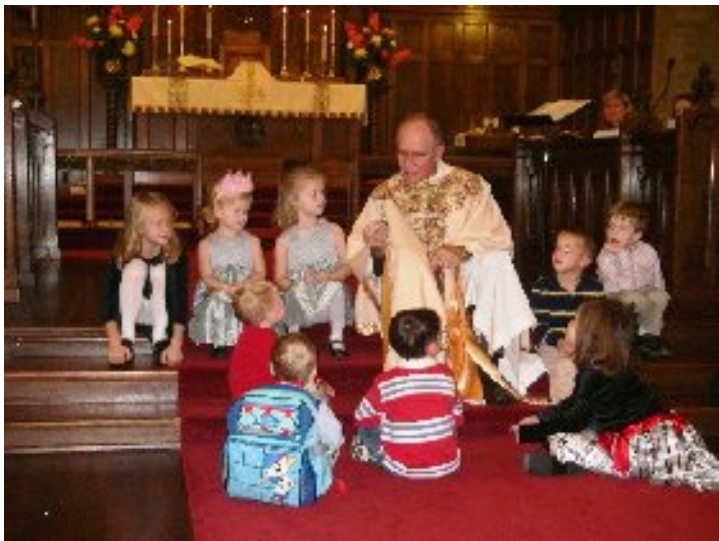
Our children enjoy the children's sermon.

At right is the Holy Cross banner designed and handmade by our Needlepoint group. Some of the ladies even give instruction to the younger ladies who are want to learn needlepoint.