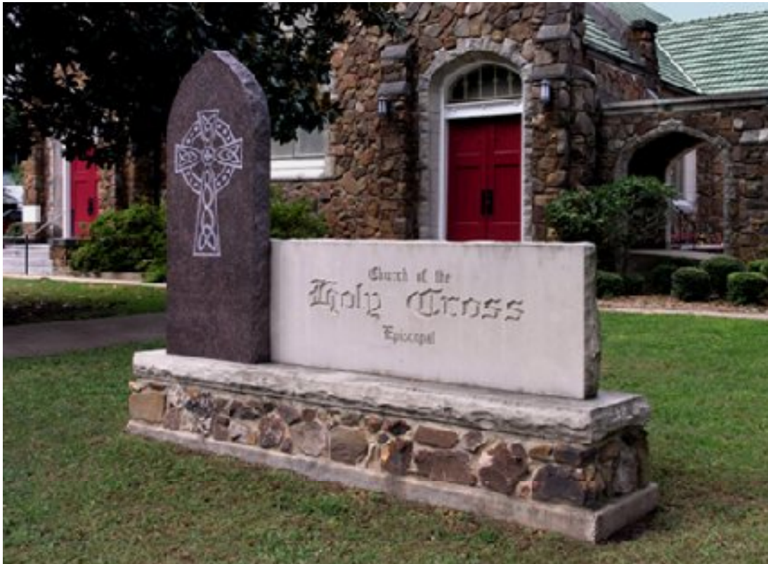
Permanent Sign at Holy Cross

We are looking forward to our next chapter with a priest whom we can love and who can love us.