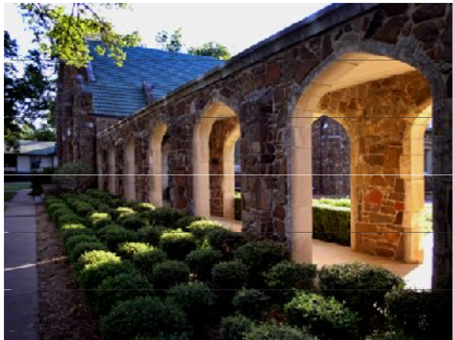
Sunlight through the Arcade that leads from the church to our

In recent years, Holy Cross has provided a Wednesday night "healing service," with the laying on of hands, that has a loyal following and many visitors.